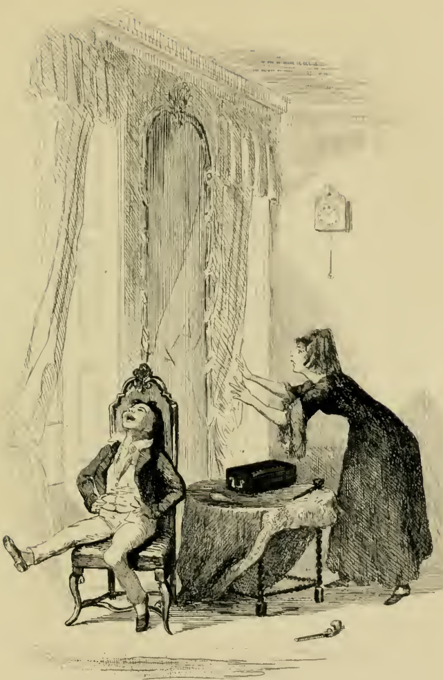
A Crutch's Shot.